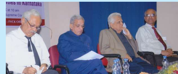
Establishment of Private Universities in Karnataka