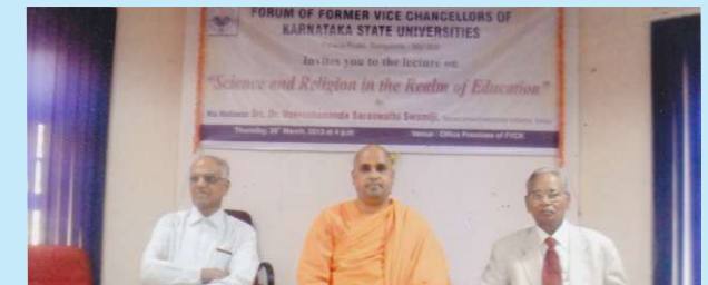
Science and Religion in the Realm of Education