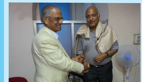
The Regulatory Conundrum of GM Crops: How to untangle the political mess?