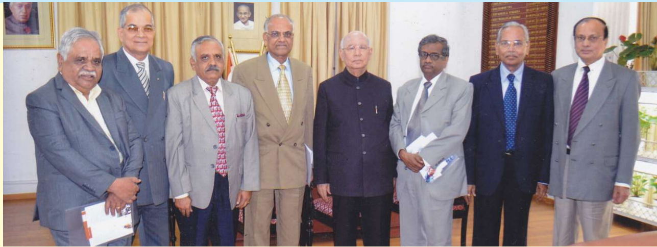
Meeting with the Governor